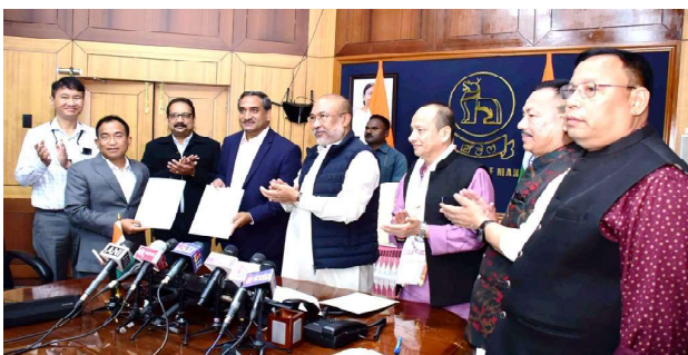
IT News Imphal, Nov 9: