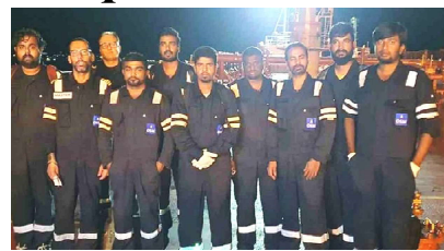
The sailors on board "MT Heroic Idun" stranded in Equatorial Guinea.

However after contacting the master/shipping agent, the Captain stated that he had been told not to take directives from the Nigerian Navy Ship. He also made a broadcast of false piracy attack call to IMB