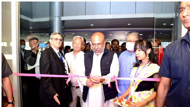
IT News Imphal, Nov 9:

Chief Minister N. Biren Singh released the Manipur Electric Mobility Policy, 2022 today, during the inaugural function of the "Two-day Awareness-cum-workshop on Electric Vehicles (EVs), Charging Infrastructure and Renewable Hybrid Energy in North-East India" at City Convention Centre, Imphal.